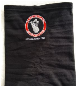
Neck Morf £8

Face mask has 2 pm2.5 filters, extra filters are 60p or 10 for £6. Free delivery Exeter area or £1.25 post per item.