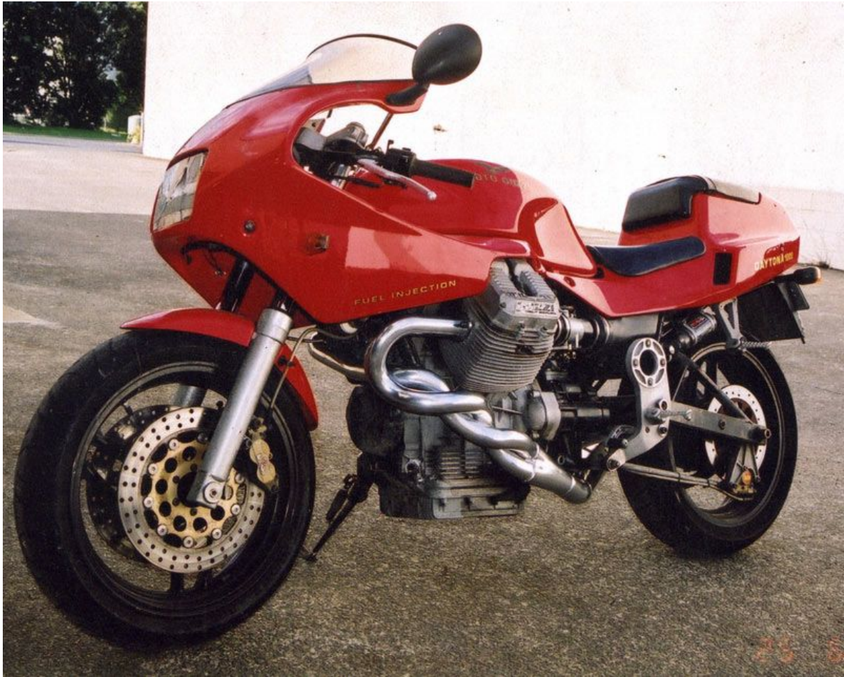
Figure 1: Moto Guzzi Daytona 1100