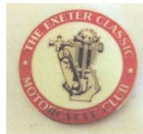
Lapel Badge £4 (Out of stock)