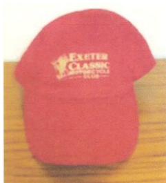
Baseball Cap £5