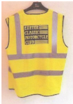
Hi Vis Waistcoat £3

Pete White holds small stocks of club regalia. If you require any items please telephone or email him (see the back page of the magazine for contact details). Payment by cash or BACS.