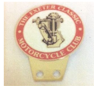
Machine Badge £15