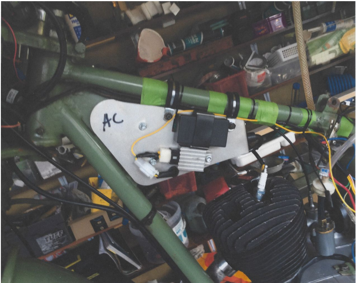
Figure 2: An easy fit under the petrol tank.

It is all cleverly concealed in the small cavity under the petrol tank (see Figure 2) and the points replacement bolting on to the existing points camshaft.