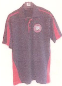
Polo Shirt £20