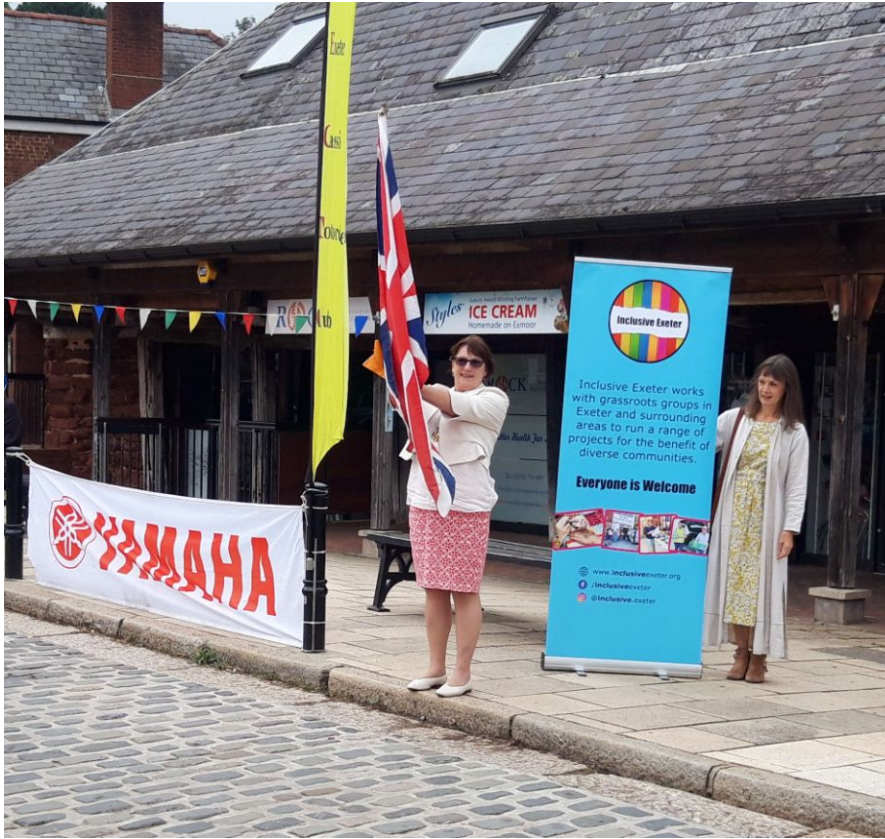
Figure 3: Lord Mayor of Exeter - Councillor Trish Oliver flagging the riders away at the start.

A total of 85 bikes registered at Exeter Quay with the money raised being split between The Lord Mayor’s Charity, Princetown Community Centre (Registered Charity) and South Tawton School.