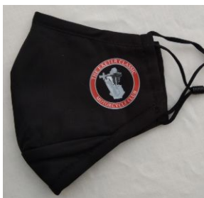
Face Mask £7.50